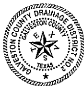
Secretary, Board of Directors